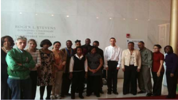
Maryland Community Connection participants and staff at the Kennedy Center on February 15, 2011

On Saturday, February 15, 2011, supported Employment participants attended a show-stopping performance of the Alvin Ailey Dance Theater at The John F. Kennedy Center.