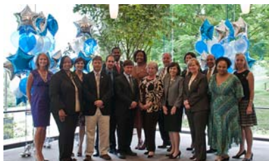
The Harry and Jeanette Weinberg Fellows Program 2010 Graduation Class of Nonprofit Leaders