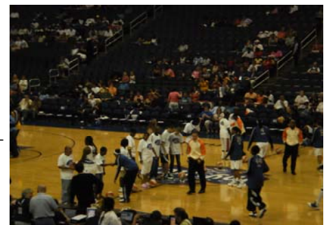
MCC Participants during Mystics Ball Exchange

Needless to say, everyone in attendance was excited and had a blast watching the teams compete!