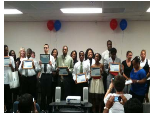
Transitioning Youth Graduates

The Arc of Prince George's County The Training Source, Inc. Ardmore Enterprises Maryland Community Connection Maryland Department of Health & Mental Hygiene/ SRMO Maryland Division of Rehabilitation Services New Horizon Supported Services Prince George's County/ Office of the County Executive Prince George's County Public Schools Resource Connections of Prince George's County UCP on the Potomac